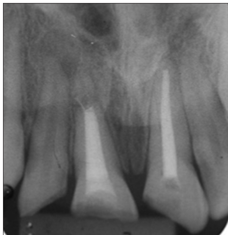
Figure 2: Initial radiograph