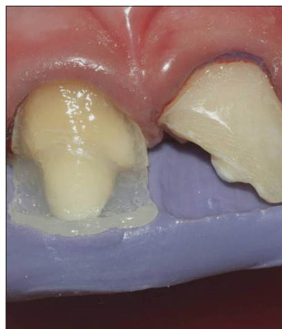
Figure 7: Reconstruction of central incisors using a silicone guide and light cure composite resin