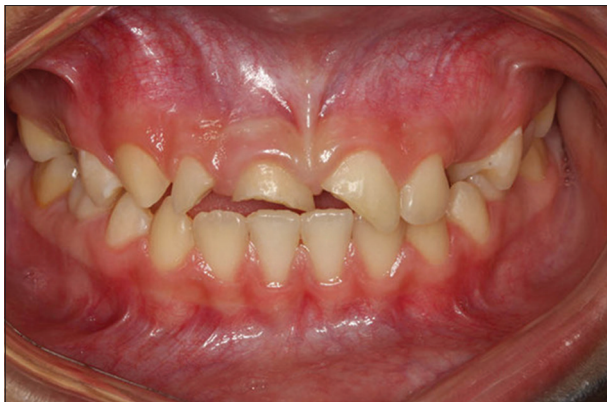
Figure 1: Coronal fracture of the anterior teeth

Thus, after explaining to his mother the advantages and disadvantages of the technique, the impression was performed to obtain a model on which the diagnostic wax-up was carried out. The waxing led to the production of a silicone guide, which enabled the construction of direct light-cured resin restoration in the fractured elements. For the selection and adaptation of the tooth that was used as biological retainer to right central incisor was necessary preparation and shaping of the canal, as described below. Two-thirds of Gutta-percha was removed from the root canal with Gates Glidden drill, considering the working length reported in radiographic examination. Afterwards, the root canal was isolated with petroleum jelly to allow the impression with acrylic resin [Figure 4]. After the polymerization of acrylic resin, a