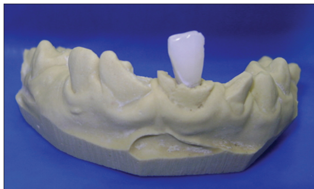
Figure 5: Teeth from human teeth bank adapted to the root canal of the central incisor replicated on the master cast

Hybrid composite restoration extremely aesthetic and easy to handle [Figure 7].