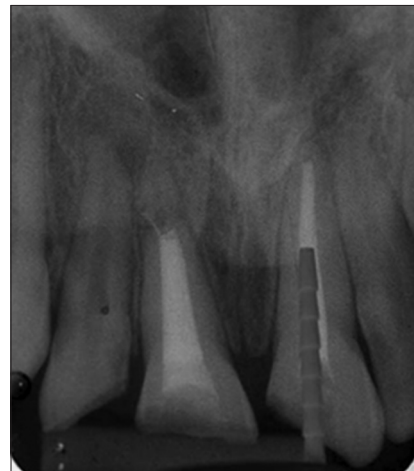
Figure 3: Selection of prefabricated fiberglass pin used in the left central incisor