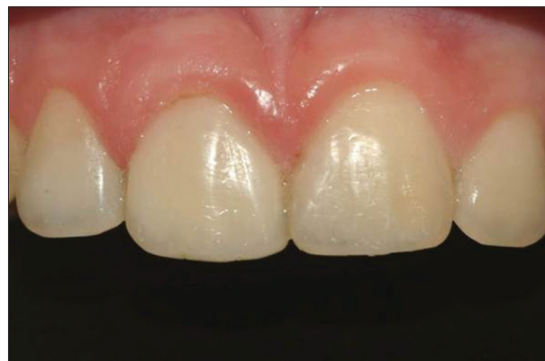
Figure 8: Clinical case after the end of the treatment