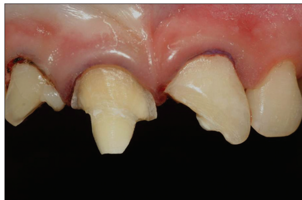
Figure 6: Biological pin inserted and cemented on right central incisor

After the end of the restorations, a polishing was performed [Figure 8]. Instructions were given to the patient and their